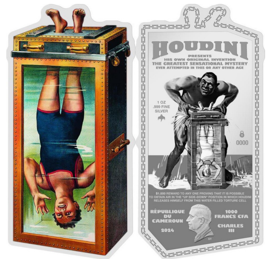
This 1-ounce, pure silver coin from Cameroon shows Houdini's famous water escape trick in color.

The one-inch by two-inch, colorized 5,000 Franc retails for US$135; only 1,000 have been minted.