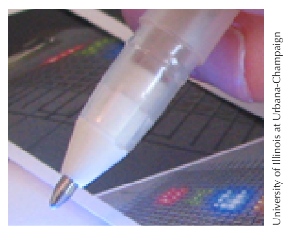
A rollerball pen filled with silver ink can produce electrical circuits just by writing.

Silver inks have been around for a while, but engineers from the University of Illinois at Urbana-Champaign have made their application as simple as writing with a pen.